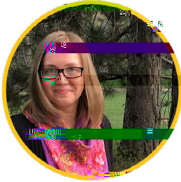
Ms. [Name], [Title]